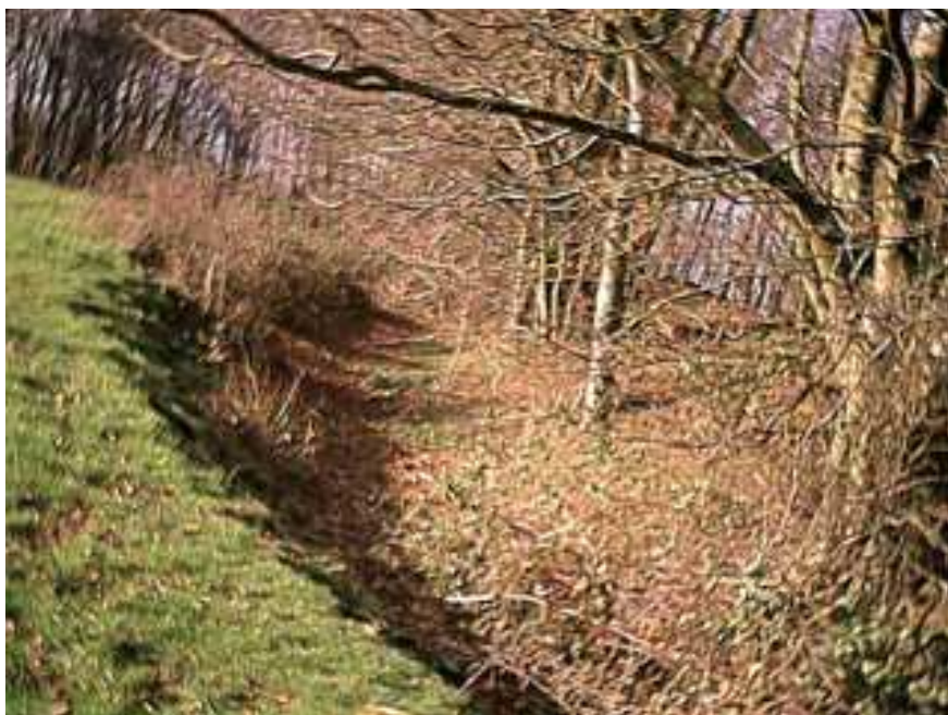
View of fosse and bank (encircled with trees) at south side of ringfort