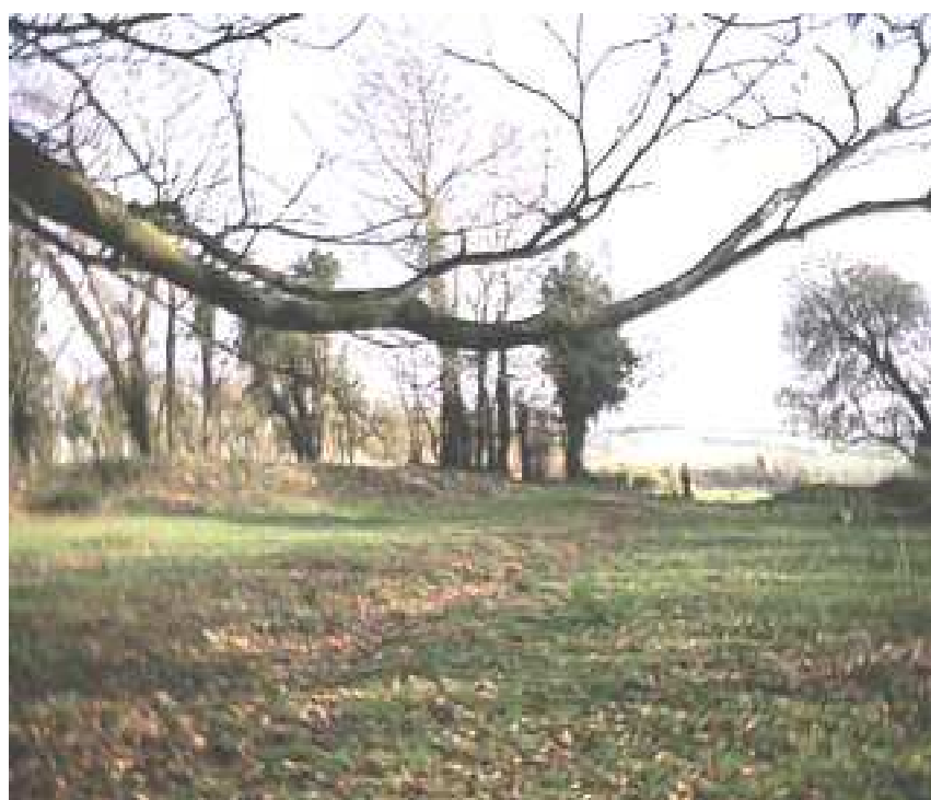
View from inside the ringfort. Entrance is to right of picture SE (where human figure is standing). The original location of the abbatoir building is to left of picture

✓ 196 KILCARRIG OS 16:6:5 (367,328) 'Idrone Mote' OD 20 27216,16229 Mound Approximately oval mound (H c. 5.5m) Dims 55m SSE-NNW x c. 28m WSW-NNE overgrown. 16:27 11-