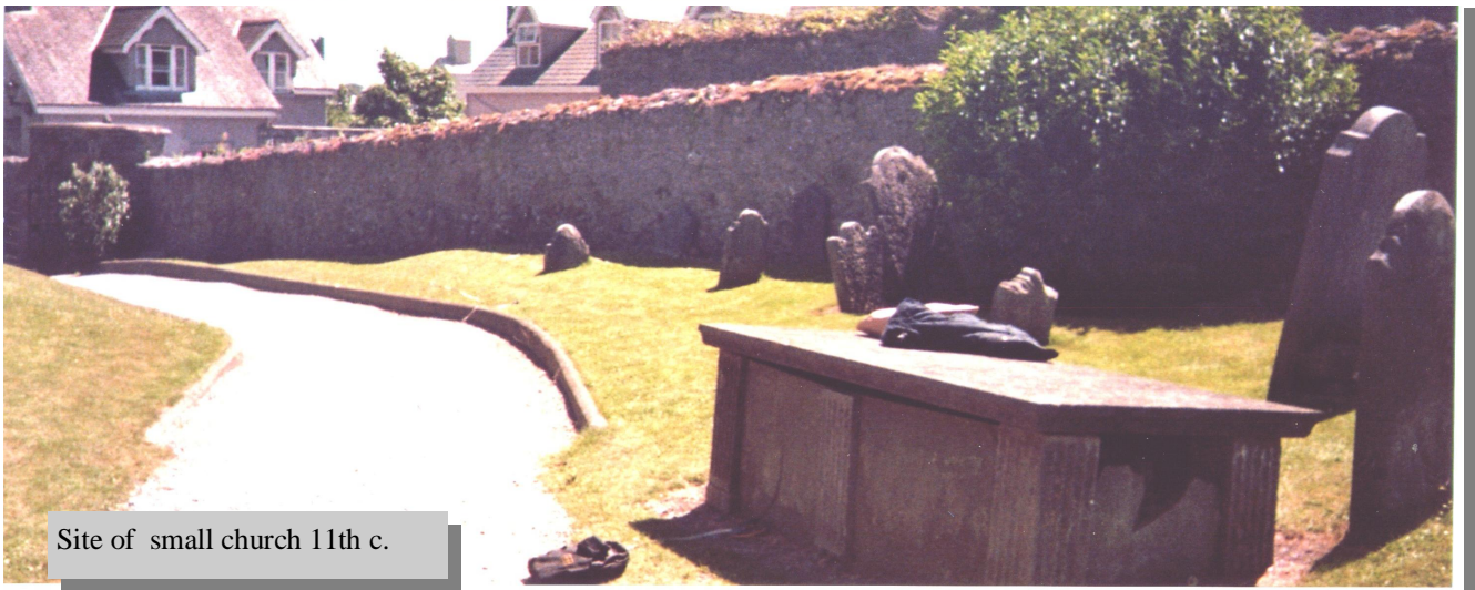
Site of small church 11th c.