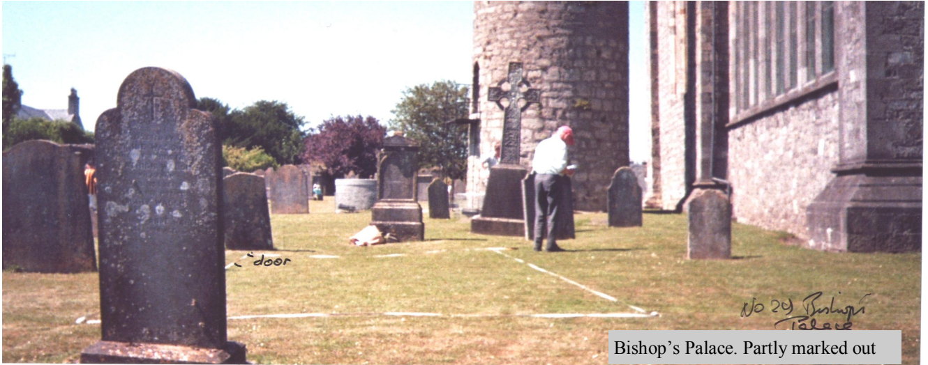
Bishop's Palace. Partly marked out