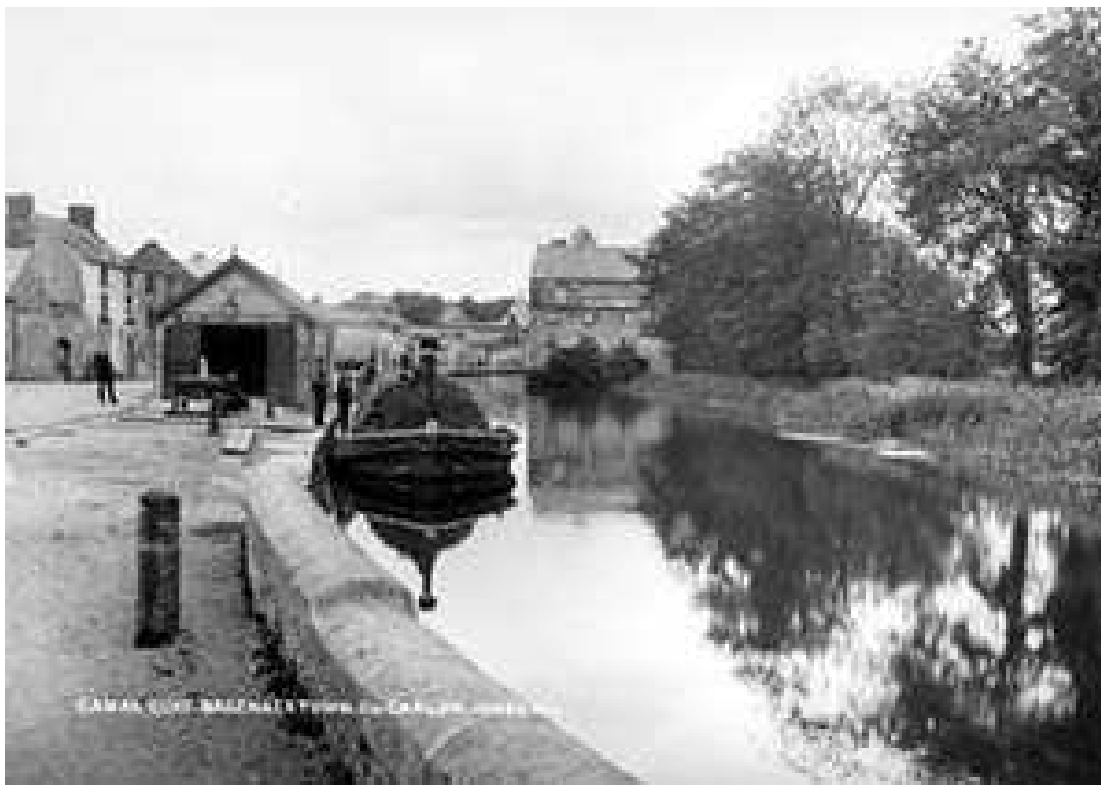
Archive Photograph of the Quay at Bagenalstown. Note the barge in foreground. In the distance is Rudkin's Mill roofed and in use.