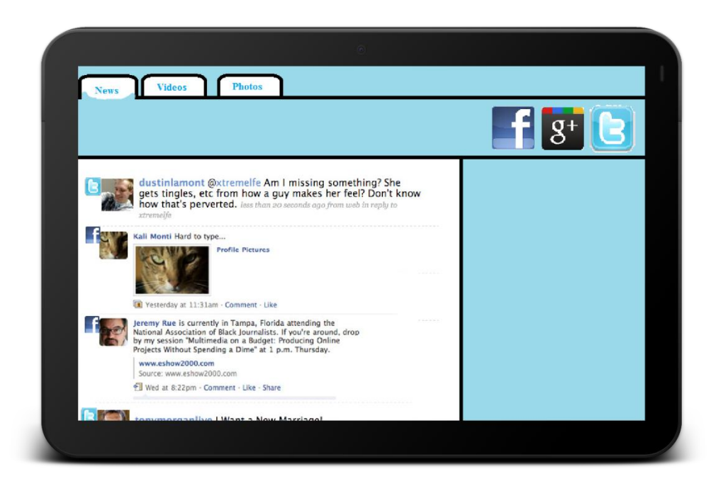
Prototype User Interface for Viewing News Feeds